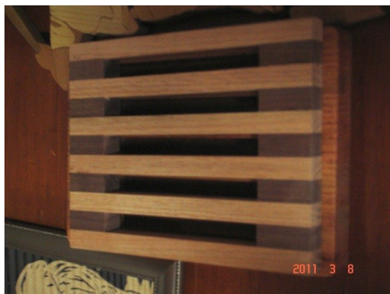
These trivets are made similar to cutting boards, but, with alternating short and long pieces to create the spaces.