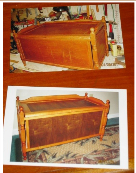
Before and after photos of Brady's blanket chest from the last meeting's Show and Tell