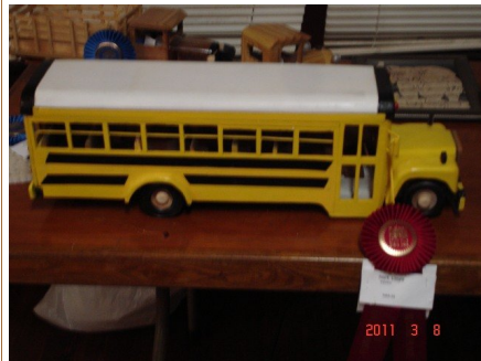
Lloyd also made a toy school bus from plywood.