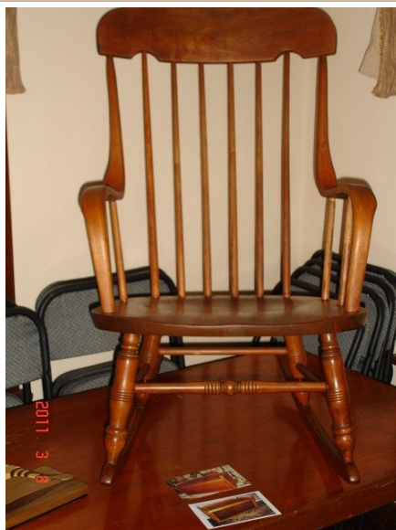
A closer look at Brady's rocker.