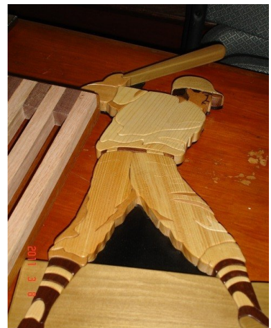
A closer look at the baseball player.