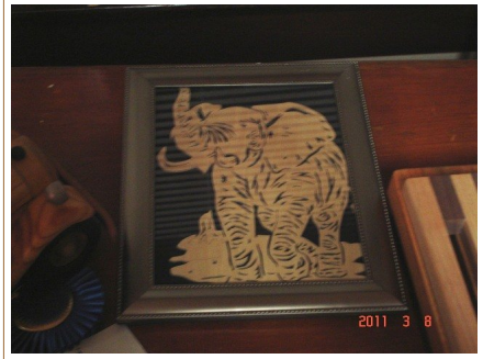
Lloyd also had an elephant fretwork scrollsawn from Baltic Birch plywood.