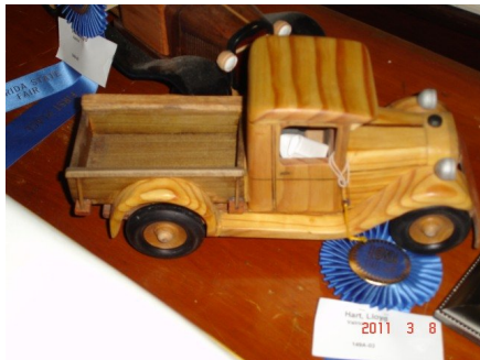
A closer look at Lloyd's 1928 pickup truck.