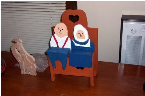
Lynn made this couple sitting on a bench out of scrap wood