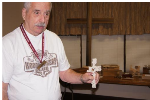
Lloyd's ornate cross is cut from white Corian! Beautiful!