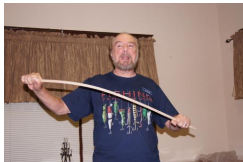
First you grab it like this.....uuhhnn!