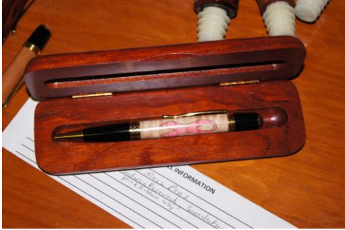
Bruce's pens included this very nice "pink ribbon" inlay in a beautiful pen box.