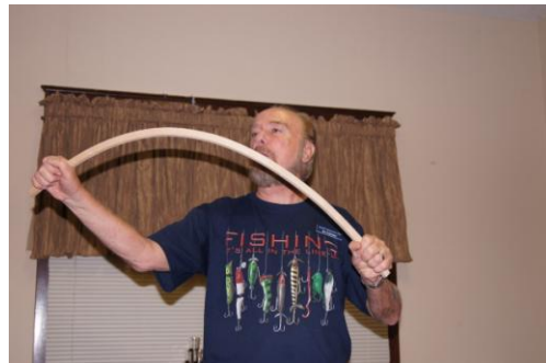
"THERE!!" It's amazing what marriage can do for you!