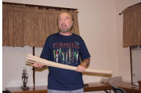
Art says, "with my new found strength and resolve from good food and clean living, I will bend these sticks!"