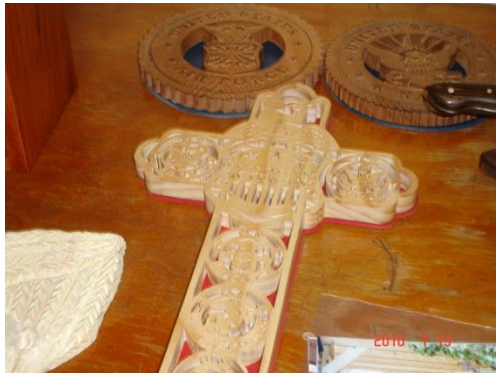
This is a closer look at the Cross and also the Navy and Air Force emblems she cut from western cedar and mounted on blue backing. I know I don't have the patience to do this! They are great, Ruth.