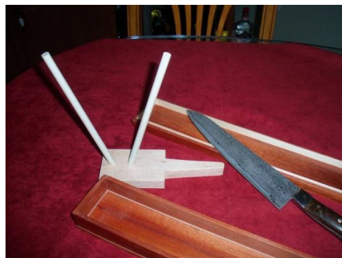
This is the Blood Wood and Maple gift box and the integrated sharpener for Frank's knife,