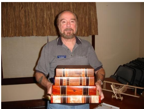
Another view of Art's "books"