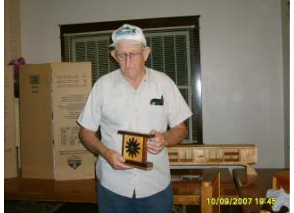
Lynn Butcher Block Chest & a clock