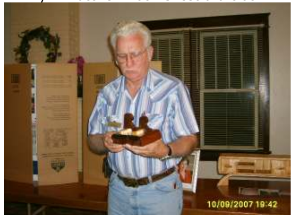
Art Chip off the old Block Initials